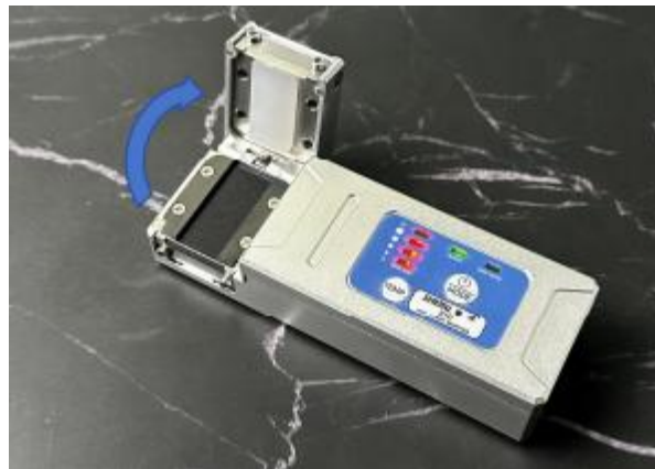
The state in Which the top cover is open

Open the cover after the device is turned on and open the cover after the fiber stripping is complete. If the device is not in use, close the top cover, because the heating plate will be heated, and the silicone pad contacts the heating plate, which will reduce the life of the silicone pad.