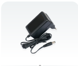
24 V 0.8 A power adapter